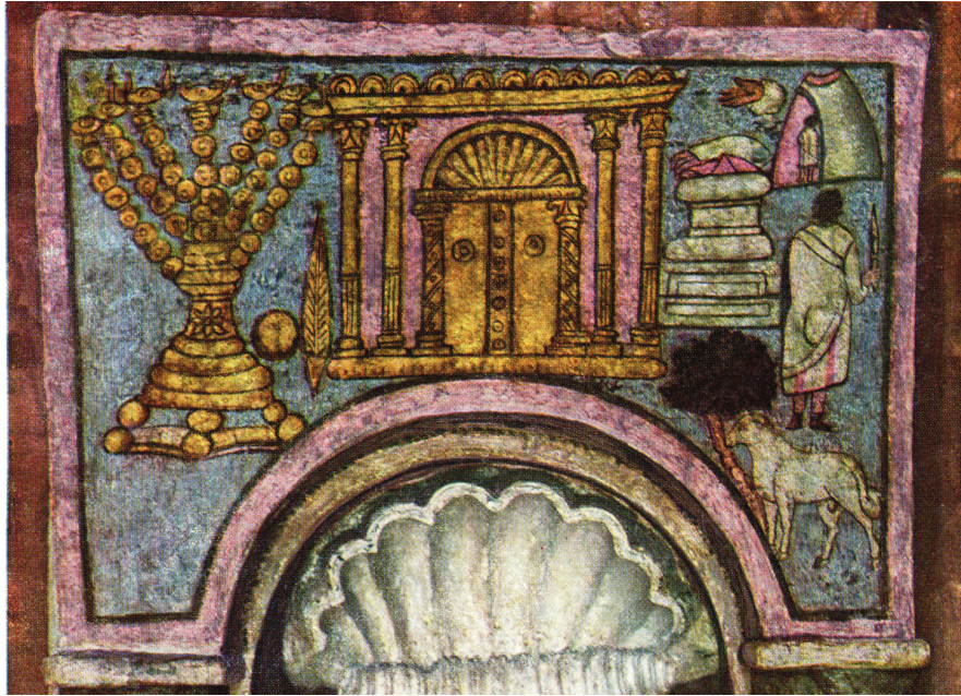
Figure 7. Detail from the Torah Shrine of the Dura Europos Synagogue 48

For example, consider this close-up of the decorations located immediately above the Torah niche in the late second century Dura Europos synagogue. 49 The entire panel is rich with symbols of resurrection and eternal life: the menorah as a stylized Tree of Life (left), a representation of the doors of the Temple in Jerusalem (center), and the sacrifice of Isaac by Abraham (right). In front of the altar on which Isaac is lying, a ram caught in a tree is shown. In the background is what appears, at first glance, to be someone in a tent. Although the figure in the background is sometimes identified as Sarah, 50 women in the other Dura murals are always shown wearing colored clothing. Besides, it is difficult to see why Sarah would have been pictured at the scene of sacrifice.