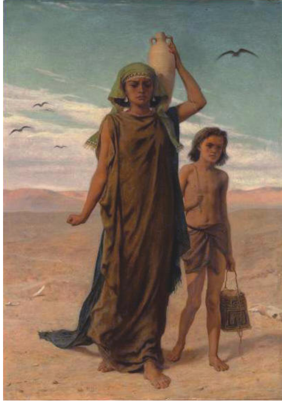
Figure 10. Frederick Goodall (1822-1904): Hagar and Ishmael , 1879