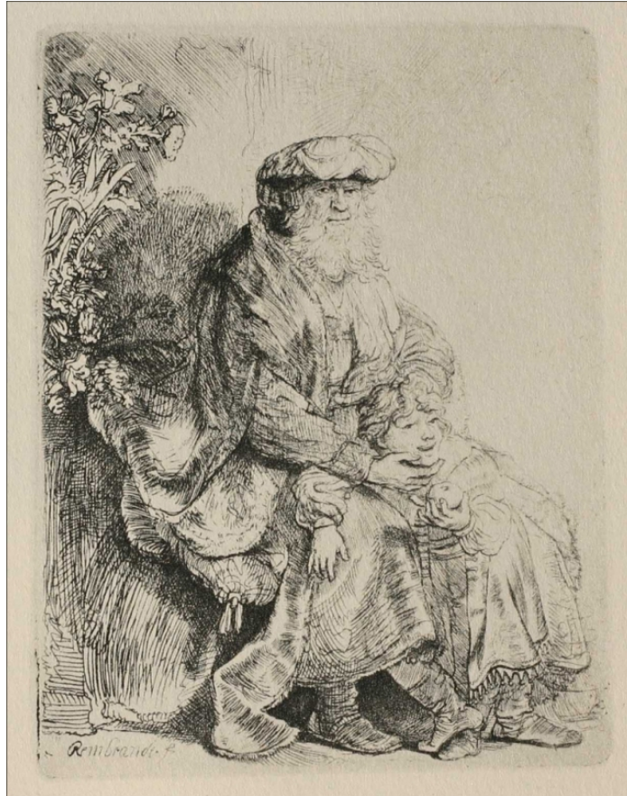
Figure 5. Rembrandt Harmenszoon van Rijn (1606-1669): Abraham Caressing Isaac