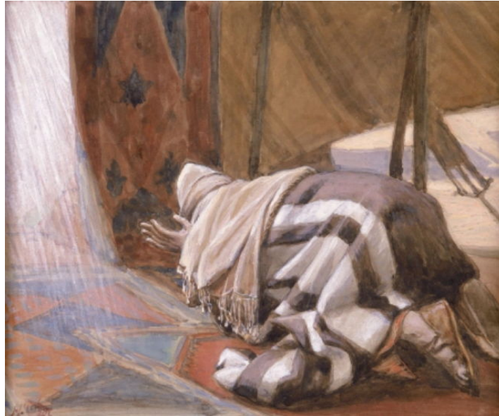
Figure 2. Jacques Joseph Tissot (1836-1902): God's Promises to Abram.