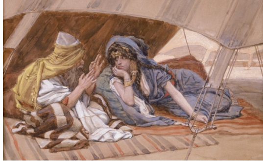
Figure 9. Jaques Joseph Tissot (1836-1902): Abram’s Counsel to Sarah .

It is she and she alone who is being tested ... this time. It is incorrect to say with Graves that “Abraham gave Sarah to Pharaoh,” for he was in no position to do so: he was completely in Pharaoh’s power — he had already taken Sarah by force — and Pharaoh was listening only to Sarah! ... [T]hroughout the story every crucial decision rests with Sarah and Sarah alone. ...