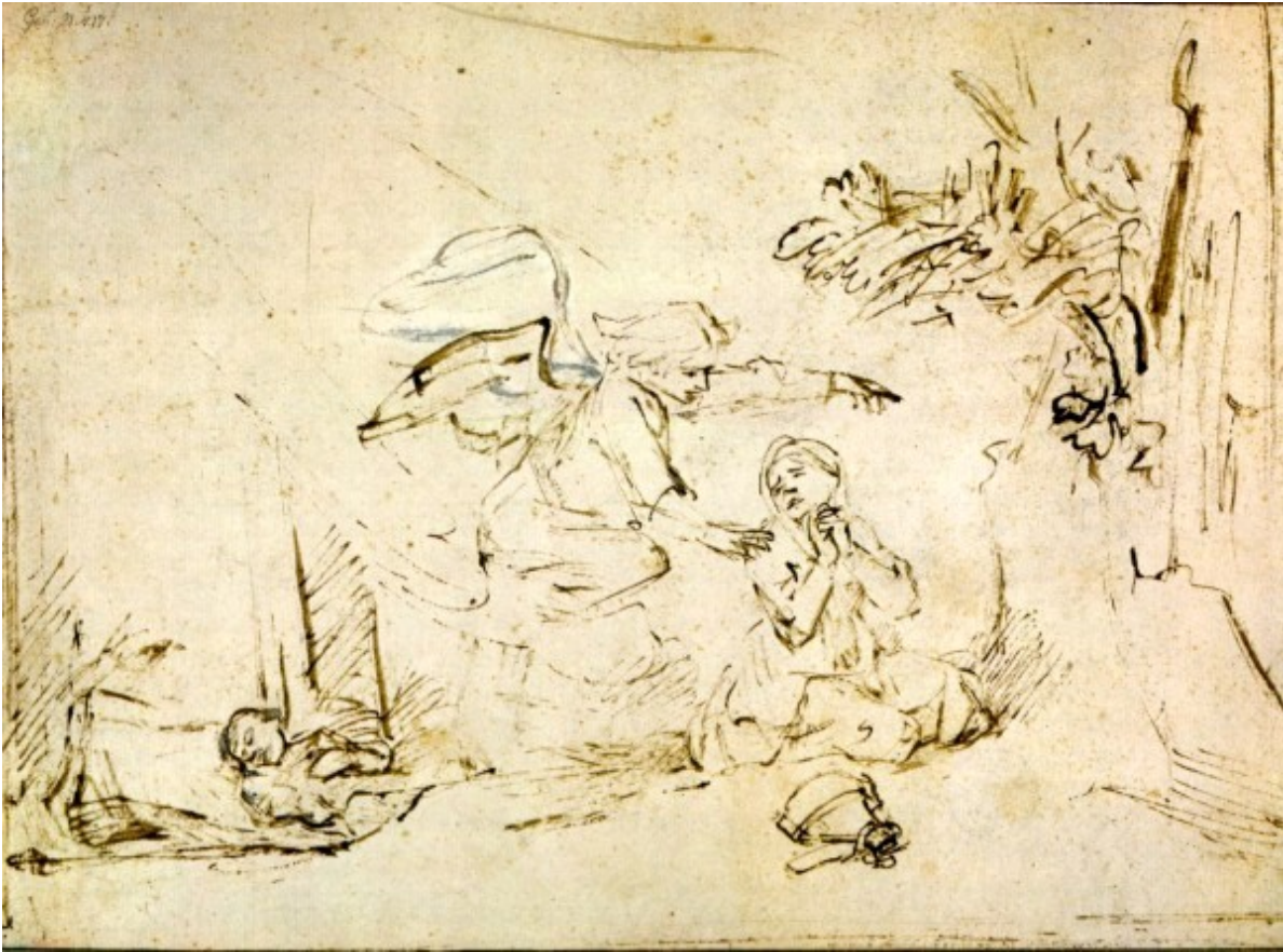
Figure 11. Rembrandt Harmenszoon van Rijn (1606-1669): Angel Appears to Hagar