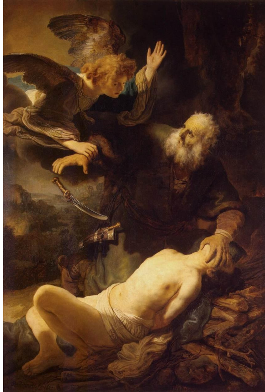
Figure 1. Rembrandt Harmenszoon van Rijn (1606-1669): The Sacrifice of Isaac .

An Old Testament KnoWhy 1 for Gospel Doctrine Lesson 9: “God Will Provide Himself a Lamb” (Abraham 1; Genesis 15-17; 21-22) (JBOTL09A)