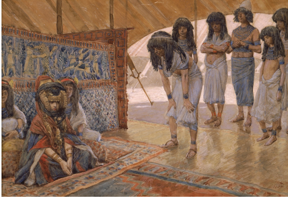
Figure 8. Jacques Joseph Tissot (1836-1902): Sarah Is Taken to Pharaoh's Palace

The test of Sarah. Although Sarah's role is backgrounded in the story of Isaac's near-sacrifice, she is front and center in Genesis 12 and 20 where she is twice taken as a prospective wife by foreign rulers Pharaoh and Abimelech. Tissot's painting shows Sarah's understandable discomfort with being ogled at close range by the passing men of Pharaoh's court.