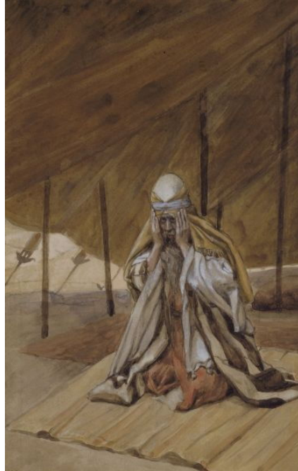
Figure 3. Jacques Joseph Tissot (1836-1902): God Renews His Promises to Abraham

The test of Abraham. The opening of Genesis 22 discloses to the reader something that Abraham did not know, namely that God's entreaty 19 to sacrifice Isaac had been made in order to "tempt" (King James Version) or "try" (Joseph Smith Translation) or "test" 20 him. By stating this purpose at the outset, the narrator of the chapter precluded "any possible misunderstanding [by the reader] that God requires human sacrifice as such," 21 a point that is especially relevant in light of Abraham's own near-death as a child by that means. 22 Instead, what God wanted was for "Abraham ... to learn something about Abraham." 23